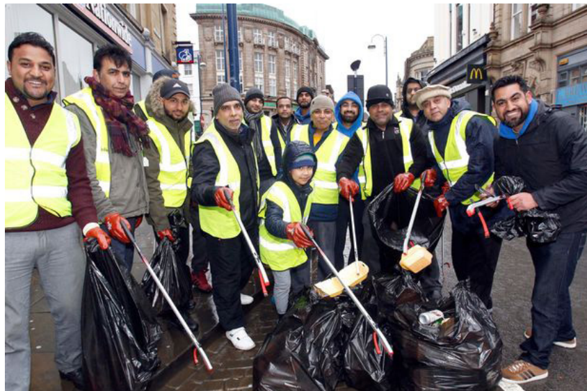
Muslims contributing to 'clean-up' initiatives by run Ahmadiyya Young Muslims Association.

While only 7.2% of donations in the UK were made online, the 17% of them that were made via mobile devices has grown between 2014 and 2015. This continued growth of online giving needs to be recognized by the charity sector as it is a major point of entry for getting the millennial generation into charitable work. 46 The incorporation of new technology and apps into the charity sector can assist with micro-donations. This was demonstrated with the UN World Food Programme's use of the Share the Meal app, which allowed donors to make a $0.50 donation with a few taps on their mobile device. Between the launch of the app at the end of 2015, over 13 million $0.50 meals have been shared. 47 While the charity sector has been slow to catch onto the use of apps and technology, it will become very valuable for raising funds as the amount of people who carry cash around is dropping and physical collection