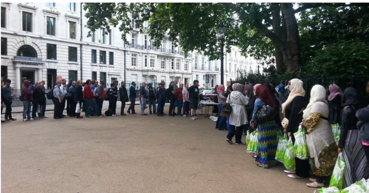
Children of Adam at work in Lincolns Inn Fields.

This report gives the spotlight to British Muslim charities and seeks to highlight the work they do for the UK and the essential role they play in British society. Bringing to light the work of British Muslim charities and the issues faced by these organisations can help rectify some of the errors of the past and begin a multilateral approach toward a mutually enriching future for Muslim charities, British society and all those who find their needs met by the acts of charity and array of services provided by Muslim charities.