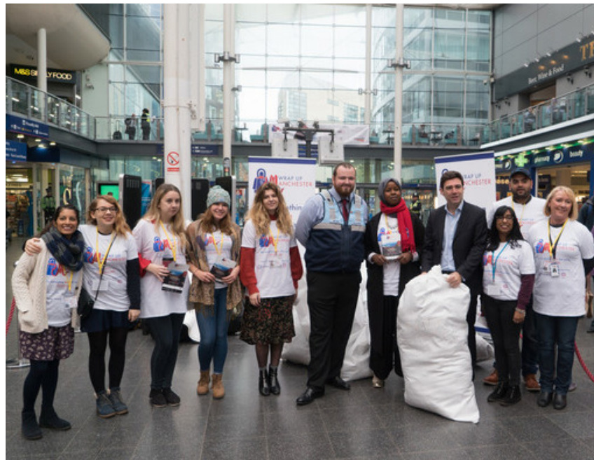
Human Relief 'Wrap Up' campaign with Metro Mayor of Manchester, Andy Burnham.

Human Appeal's annual 'Wrap Up' campaign, in partnership with Hands on London, saw the charity collect a combined total of nearly 25,000 winter coats and other warm winter clothing for rough sleepers, refugees and other vulnerable people in Greater Manchester, London, Glasgow and