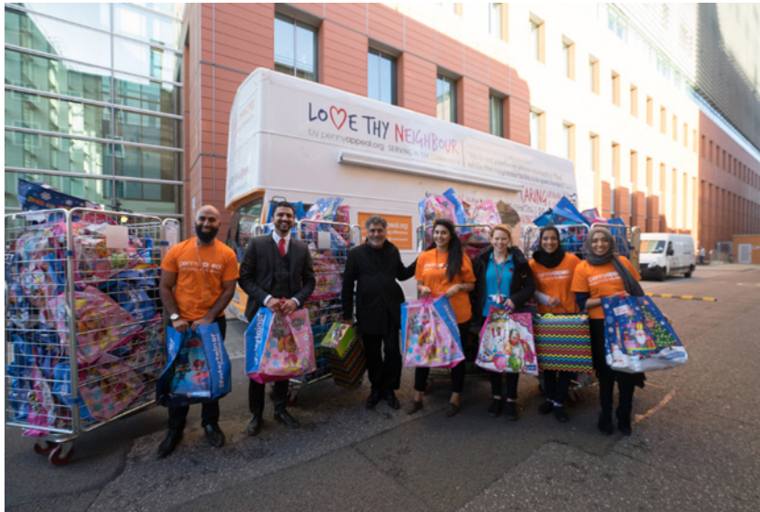
Penny Appeal and James Caan distribute presents to sick children at Great Ormond Street Hospital in London

Interfaith cooperation even goes beyond the more focused goal of charitable organisations. The dialogue that occurs during these events, at times even becoming the focus of an event such as a seminar or panel discussion allowing for the community to discuss important topics. Fears and differences are dispelled when members of each religious group come together and become