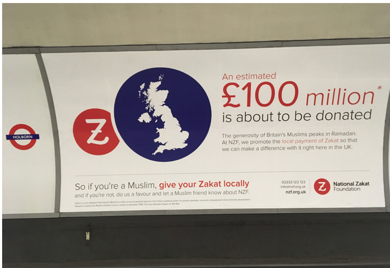
National Zakat Foundation advertisements on London Underground, April 2018

financial resources, resettlement support, and funeral costs. GMRU established the first hotline for families affected by the fire. In the first week, we heard how GMRU raised and distributed over £148,000 progressing in week two to work with fifteen different charities on the ground to supplement the work of statutory agencies. Over 3,000 meals were distributed to families affected by the tragedy. To this day, these charities work as the UK continues to recover from this tragedy. 6