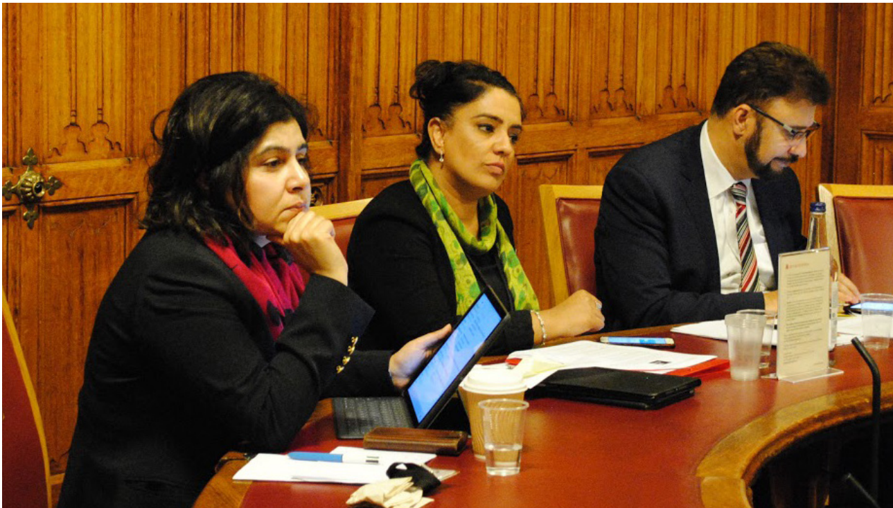
APPG members hear evidence from Muslim charities in Parliament, November 2017

the tremendous significance of their work and its value to British society. We hope too that our efforts will encourage others to look upon British Muslims anew and recognise that this group of less than three million people through their charitable activities punch far above their weight.