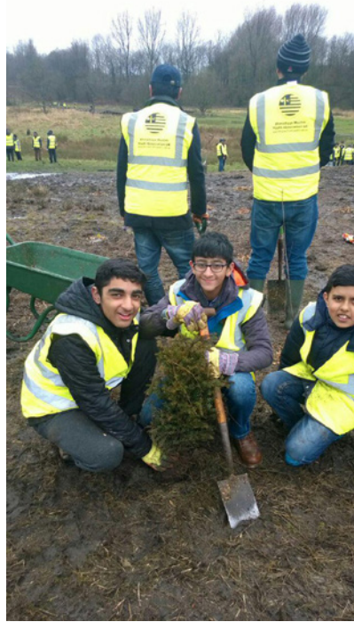
Muslims contributing to 'green-up' initiatives run by Ahmadiyya Young Muslims Association.

MDA also contribute their work through developing health technology to aid the underprivileged. One app they are working on can provide antenatal care for pregnant refugee women. These endeavours were even recognised by WIRED Health in 2016 as one of the top-20