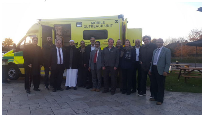
Mobile medicine for the homeless, Muslim Community and Education Centre, Palmers Green mosque

The impact of British Muslim charity work is also seen in the mobilisation of its people into the greater British community. Again, charity is more than simply pounds or hours donated. Charity provides a wonderful opportunity for all elements of society to translate their talents and passions into acts of neighbourly love. While soup kitchens, food banks, and temporary shelters